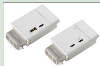
Inline USB Charging Modules.