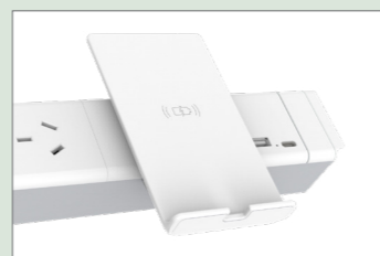
Helistand 15W Integrated Wireless Charger

Quick-fit desk-clamps Features self-fastening paddles for easy top-side mounting.